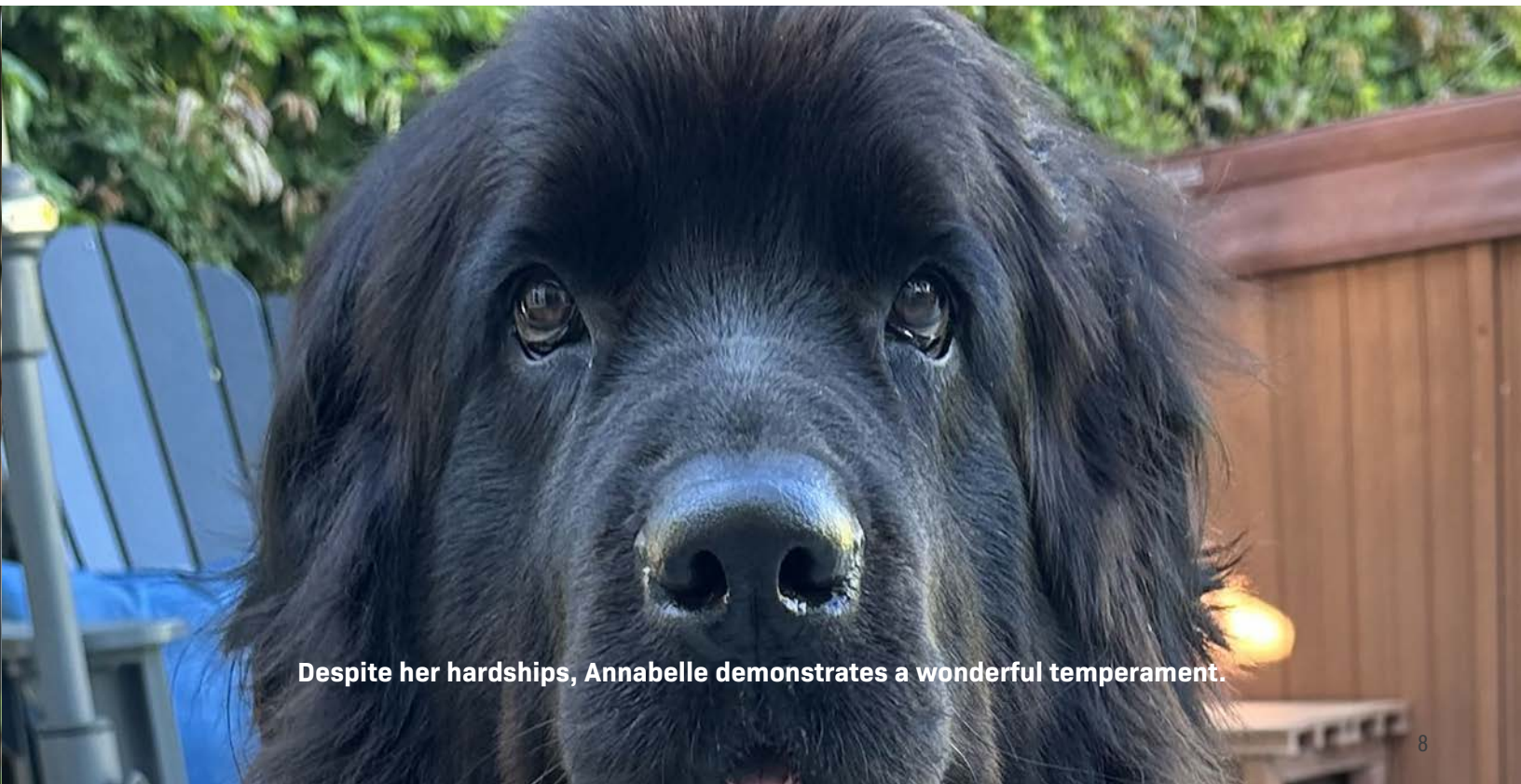
Despite her hardships, Annabelle demonstrates a wonderful temperament.

* NCA Rescue policy: Grants are available to Regional Clubs' Rescue Services to subsidize up to 50% of estimated veterinary services costs. Applications for these grants are reviewed by the CTMB to determine correct diagnosis and prognosis. A grant application up to $1,000.00 is reviewed by the NCA Rescue Chair for approval. A grant application over $1,000.00 is reviewed by the NCA Rescue Chair and the NCA Charitable Trust Management Board Chair.