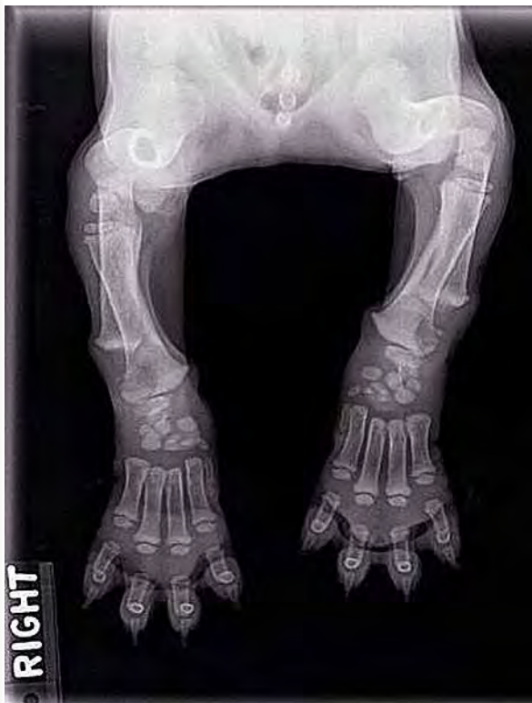
X-ray of an affected 6 week old

OFA and our committee vets confirmed 8 cases involving 2 litters and 6 individuals. Those not affected had retained cartilaginous cores or valgus deformities. All submissions except one which was an older rescue dog were on dogs 6 months or under, generally between 14 and 17 weeks of age (after placement).