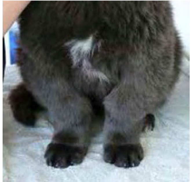
A bilaterally affected 4 month old

previously diagnosed in Nova Scotia Duck Tolling Retrievers. It is also suspect in Chesapeake Bay Retriever, although the breed club has yet to confirm. It is of interest that these breeds all have historic ties to the Newfoundland.